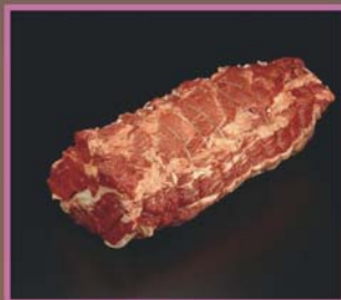
CHUCK ROLL 116