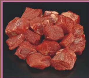
STEW MEAT 135

CUT NUMBERS REFER TO IMPS (INSTITUTIONAL MEAT PURCHASE SPECIFICATIONS) CURRENTLY IN USE FOR BEEF. "THE MEAT BUYERS GUIDE" ---1997.