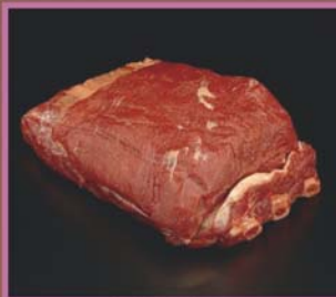
SHORT RIBS 123