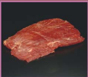
FLANK STEAK 193