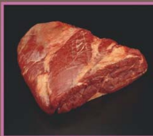
SHOULDER CLOD 114