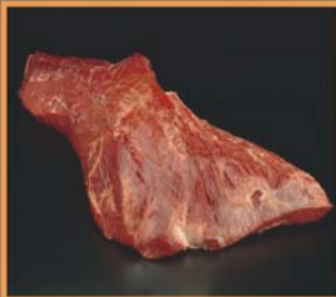
OUTSIDE ROUND, flat (bottom flat) 171B