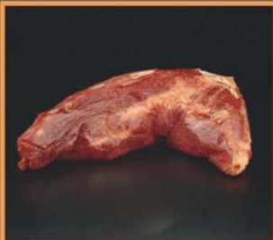
BOTTOM SIRLOIN TRI-TIP 185C