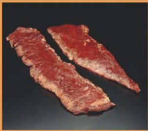
SKIRT STEAKS 121C/121D