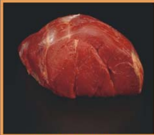
SIRLOIN TIP (peeled knuckle) 167A