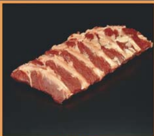
BACK RIBS 124