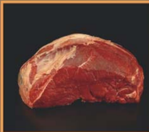
INSIDE ROUND (top round) 168