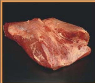
OUTSIDE ROUND (bottom round) 170A